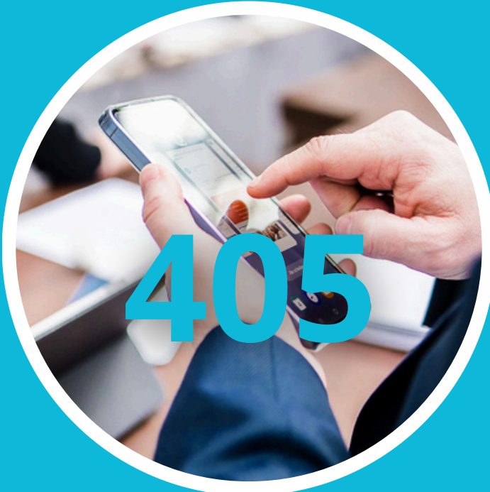
VIRTUAL ATTENDEES FROM ALL OVER THE WORLD