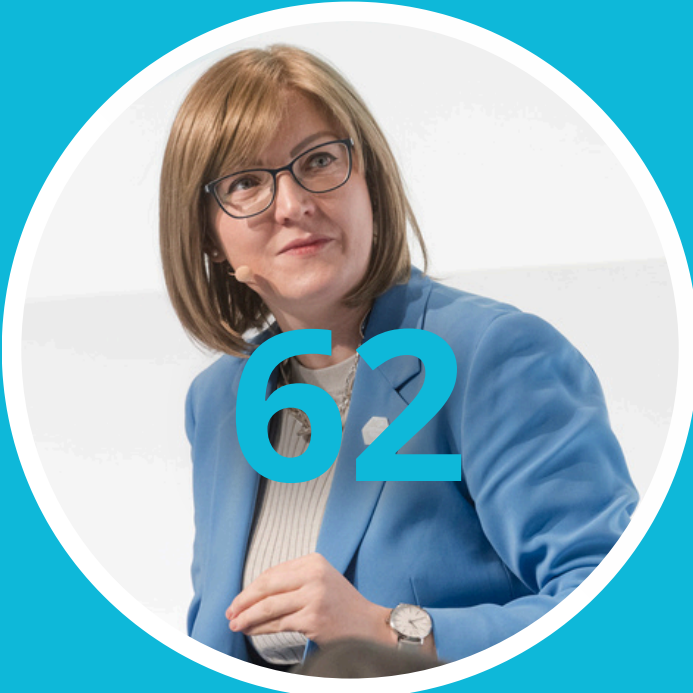
SPEAKERS LIVE ON STAGE