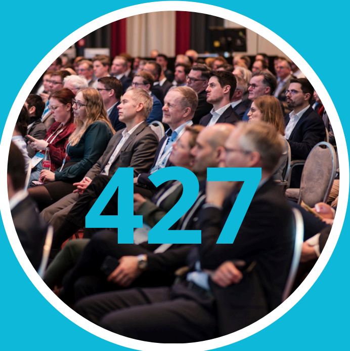
PARTICIPANTS IN BERLIN