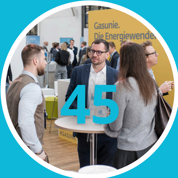
SPONSORS, PARTNERS & EXHIBITORS