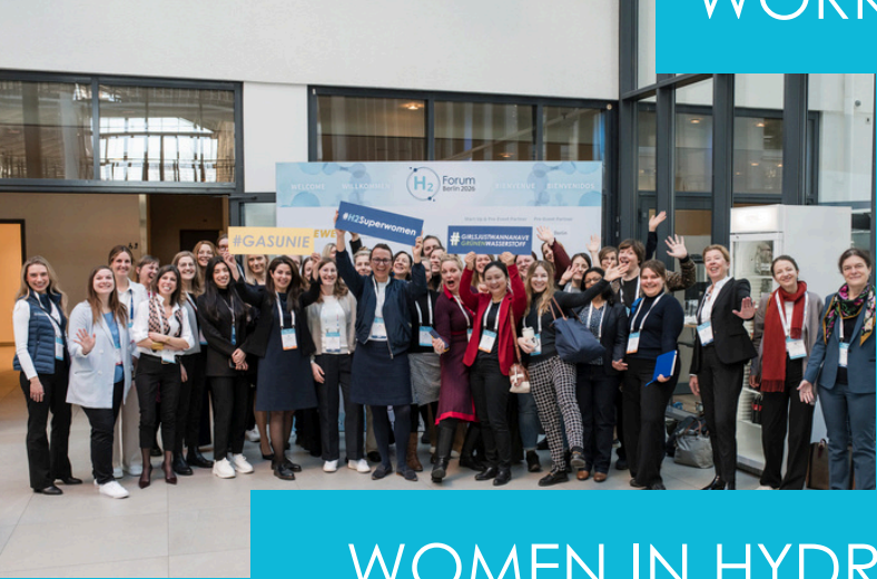
WOMEN IN HYDROGEN BREAKFAST