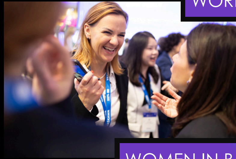
WOMEN IN BATTERY MEET-UP