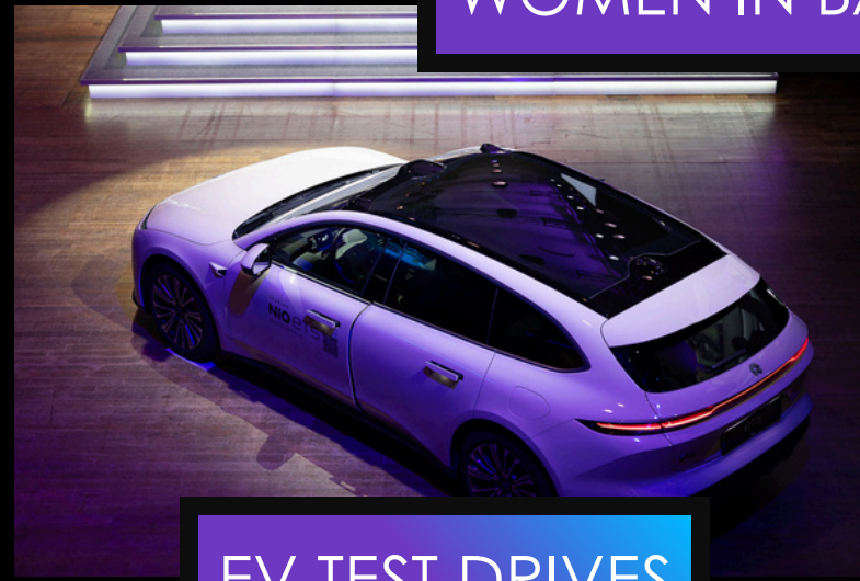
EV TEST DRIVES